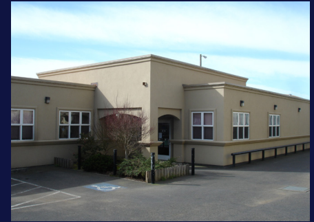
RCMS Point Arena Dental Office

August 2003 New dental building opens in Point Arena, services provided by RCMS