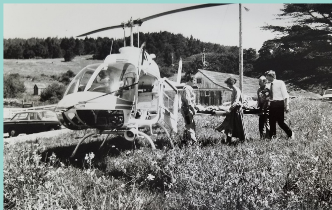
Helicopter landing at Stewarts Point 1979

"...timid beginnings, sure confidences, passionate maelstroms, generosity of all kinds, self-questioning, helping hands, silent prayers, false starts, and renewed determination; over and over we struggle to reach our goal of helping us all to live each day with joyous health. RCMS is strong because you are strong."