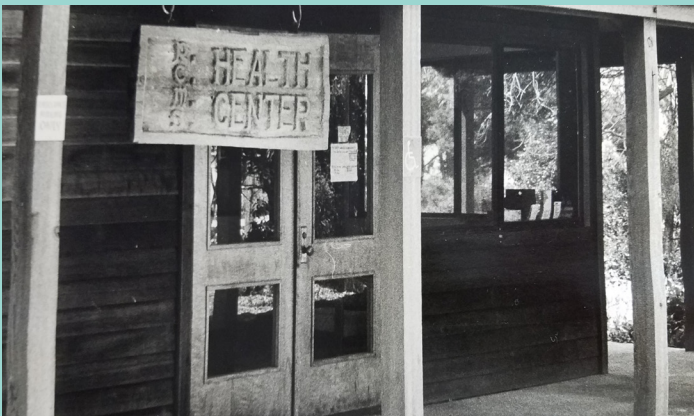
RCMS at Stewarts Point