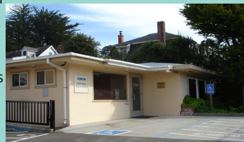
Point Arena Medical Center

The Point Arena Medical Center Board (PAMCB) operated the Point Arena Medical Clinic separately from RCMS. In 2000 they received a $1 million donation from the late Alvina Cerruti to improve healthcare resources in the Point Arena community. PAMCB used this donation to build the Cerruti