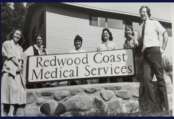
RCMS Gualala 1985